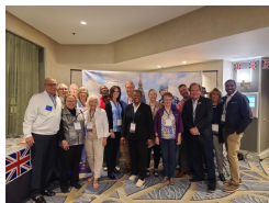
District 6900-PDGs, DG, DGE, DGN & Emerging leaders.