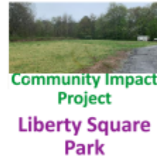
Liberty Square Park Cleanup 8am - 12pm See Gabriel Prado

We need help on September 16th! Starting with our Liberty Park Clean Up, to Rivers Alive Cleanup, and then 9/11 Cookout! What times can you sign up for?